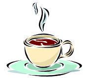
Table top sale and Coffee Morning Monday 3rd December 9.30am ~ 12pm

The cost to have a table is £5 each. Call Sian on 554181 or Liz on 555269